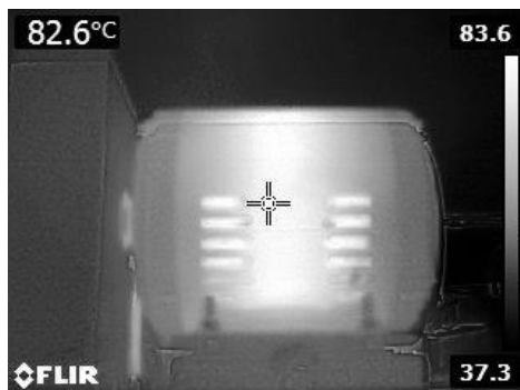
Figure 1. Thermographic picture of a motor reaching 82.6 C°.

Additionally, with the knowledge that heat loss is one of the factors that lower devices efficiency, thermographic photographs were taken to visualize potential energy losses. In general, air conditioning systems seemed to be affected by the generation of heat from other devices such as motors and ovens. Electrical motors generate a very large amount of heat; in some cases, it is possible to exceed 80 °C, as shown in Figure 1. The use of fans for ventilation was found also is a problem because they were old appliances. At this regards, Figure 2 displays a fan that can work with temperatures reaching 78 C°. Furthermore, ovens in maquiladoras often are not insulated, as a result, conditioning systems work in unfavorable conditions consuming more energy than usual. Figure 3 and Figure 4 illustrate this situation. Finally, during walkthrough, several heat leaks were found in the piping systems. This contributes in the growth of the indoor temperature in the maquiladora facilities. See Figure 5.