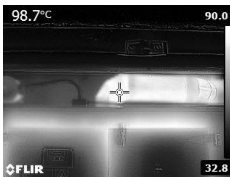
Figure 4. Thermographic picture of an oven reaching 98.7 C°.