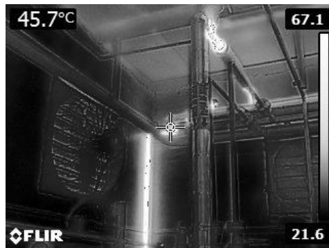
Figure 5. Thermographic picture of heat leaks in piping systems reaching 45.7 C°.