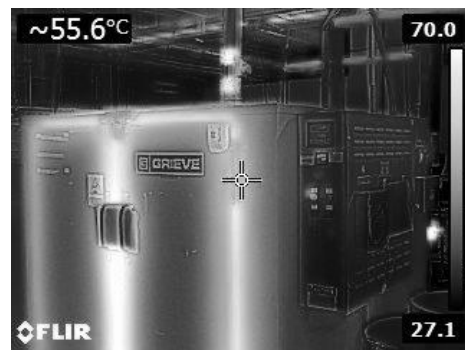
Figure 3. Thermographic picture of an oven reaching 55.6 C°.